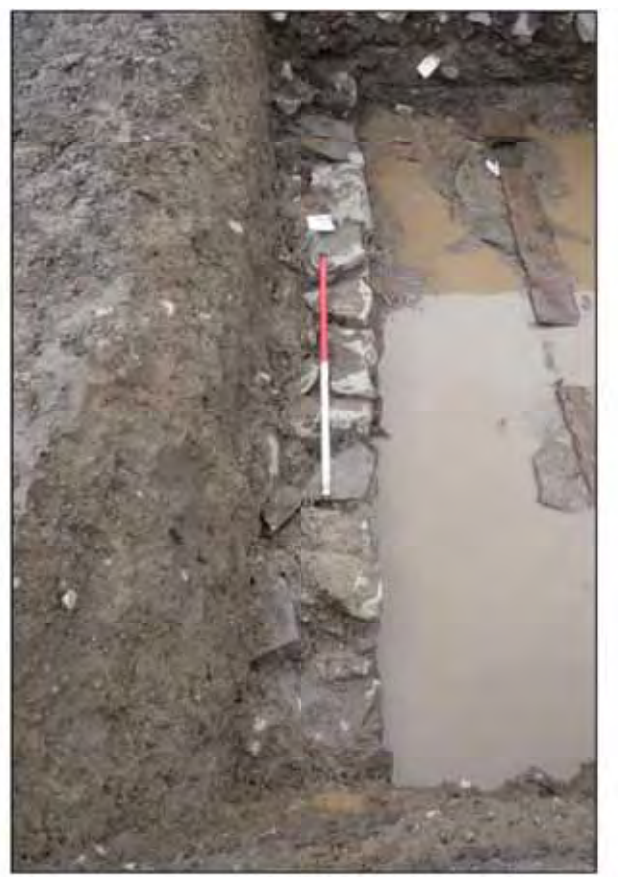
Plate 31. Southern wall (027) of culvert (005) facing west.