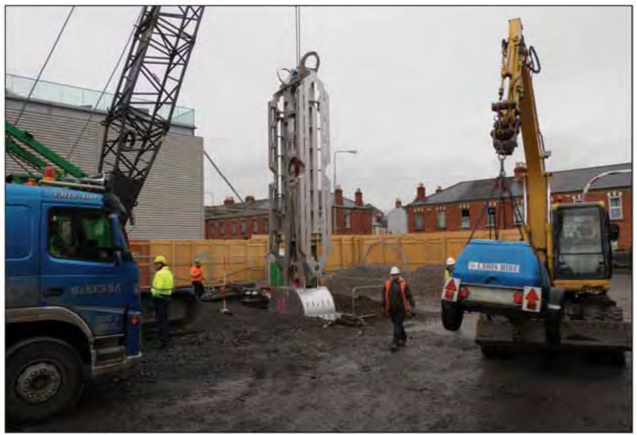
Plate 28. Hydromill excavating Mater D-Wall test panel facing north-west.