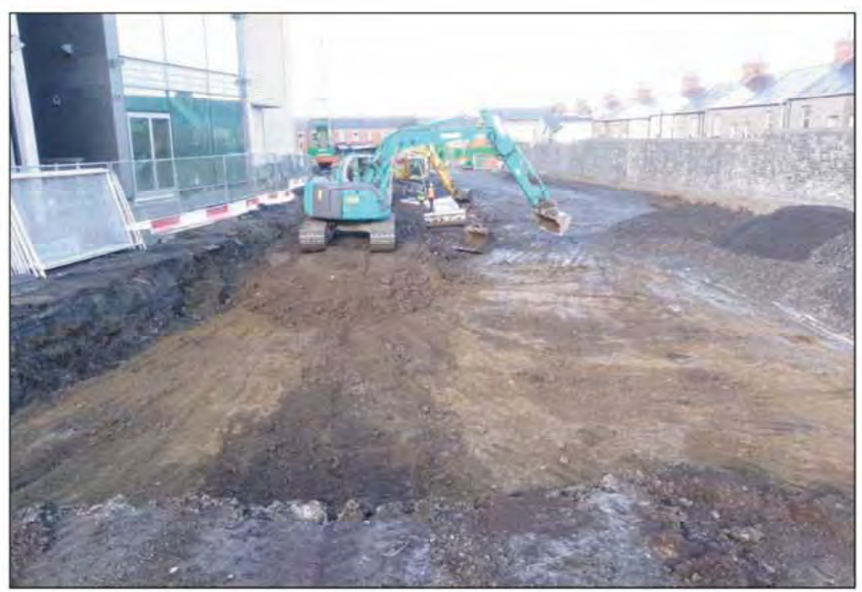
Plate 26. Outline of sewerage main evident along western side of the site facing north.