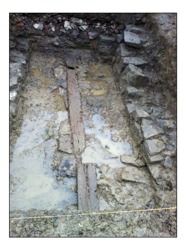
Figure 1: Wooden culvert in situ

The results of the excavation at the Mater Stop Box site identified a post-medieval culvert (005) that most likely functioned in water management or the removal of water from the area. The culvert was constructed from of a stone wall along the northern edge of the cut and a timber plank (006) along the centre, which was believed to represent the surface of a timber plank built conduit. In addition a wooden platform (033) was identified above stone-lined drain (028) within the terminus of the culvert; this may represent the floor or base of a structure (Hession 2012). A total of eight wood samples were retained from the excavation; sub-samples were obtained from all worked or possibly worked timbers identified at the site.