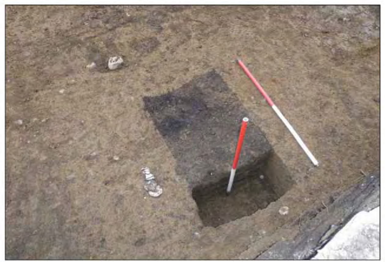
Plate 25. Geotechnical test pit (012) identified during monitoring programme facing south-east .