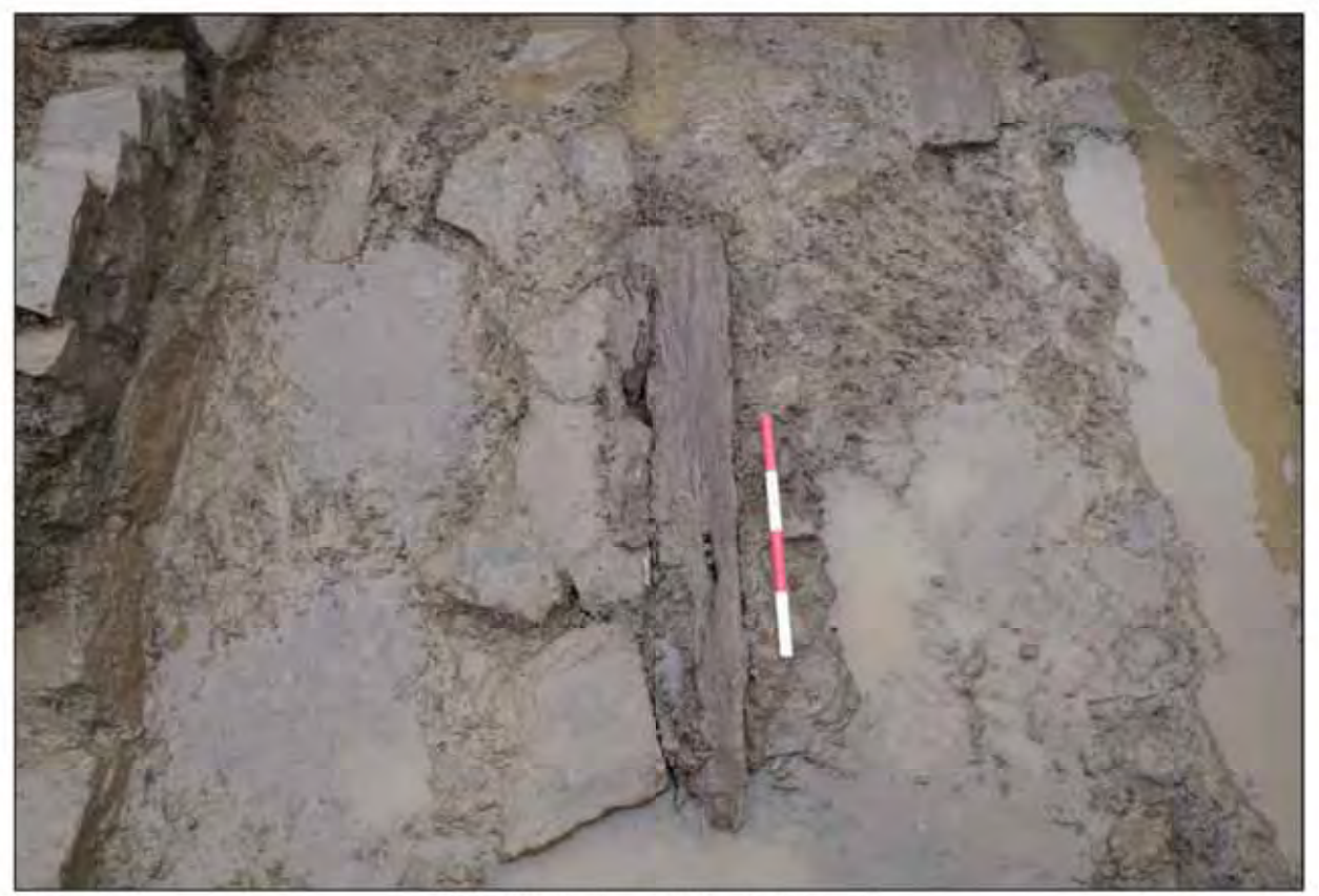
Plate 33. Timber 1 (006) facing west