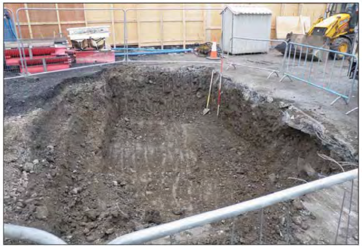
Plate 27. Mater D-wall test panel excavation facing west.