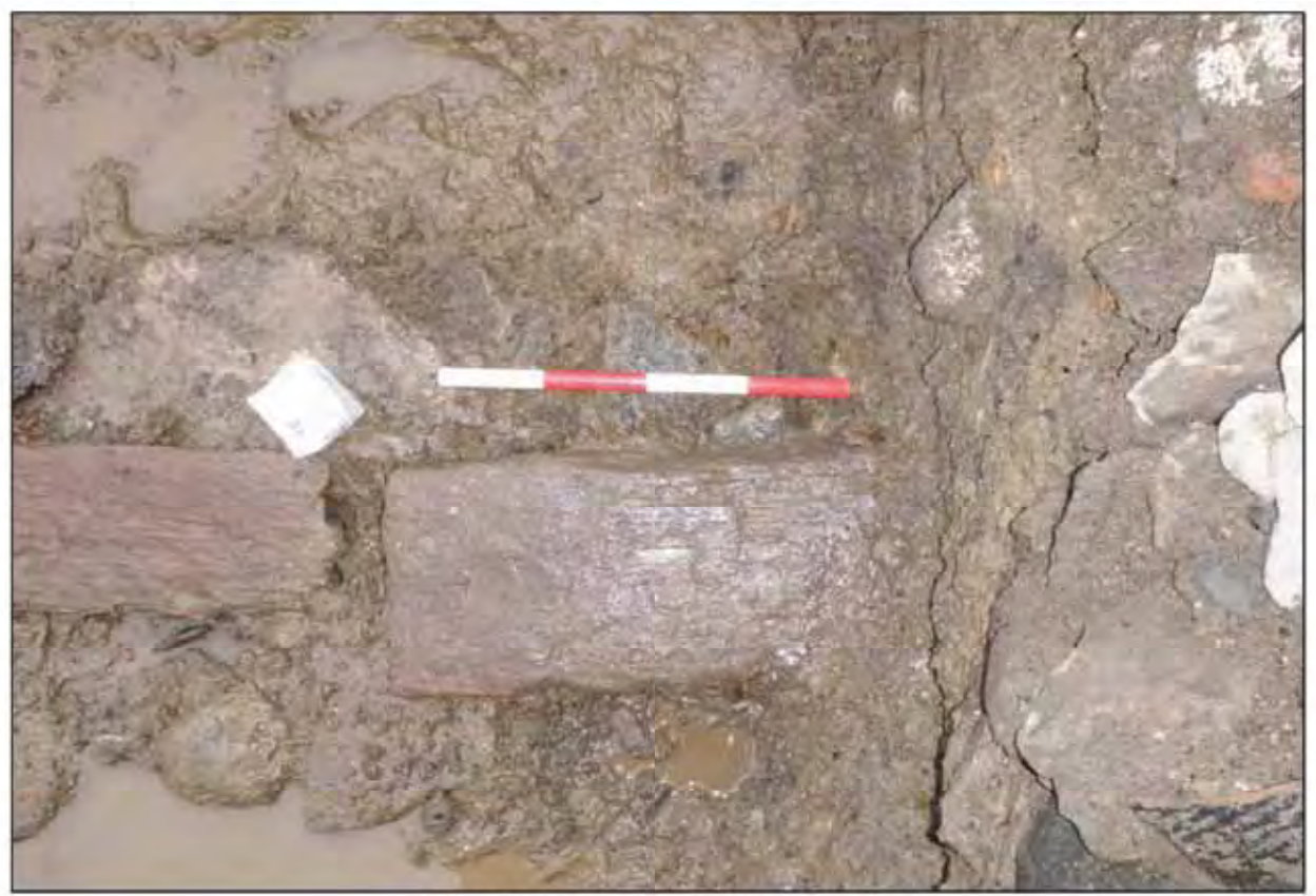
Plate 36. Timber 4 (006) facing south.