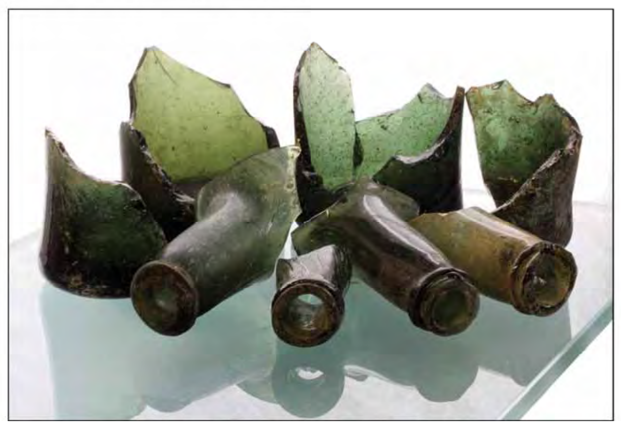
Plate 42 - Selected artefacts from the glass assemblage