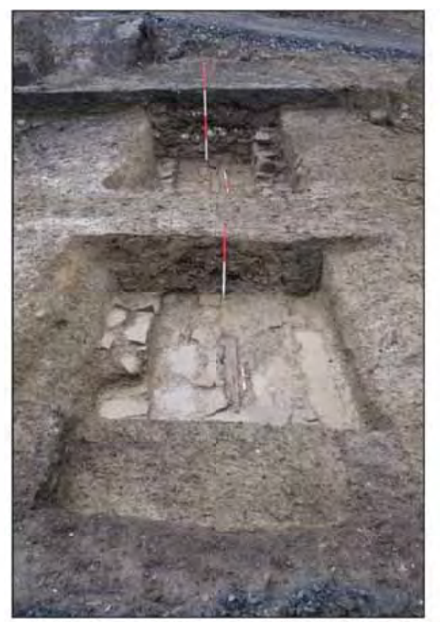
Plate 29. Mid-excavation shot of culvert (005), walls (026), (027) and stone lined drain (028) facing west.