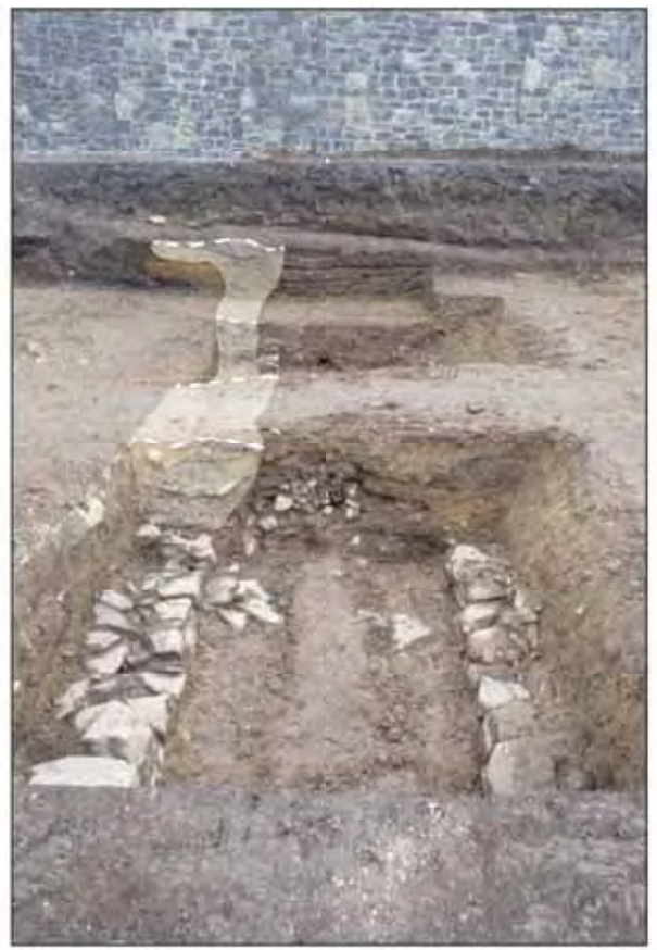
Plate 39. Robber Trench (008), highlighted, and associated fills facing east.