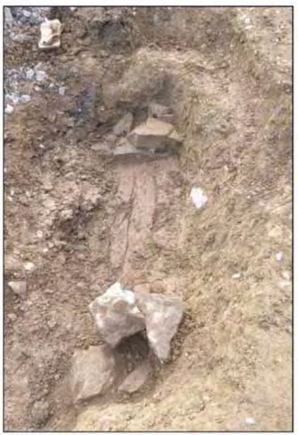
Plate 38. Timbers 5, 6 and 7 of (033) facing south.