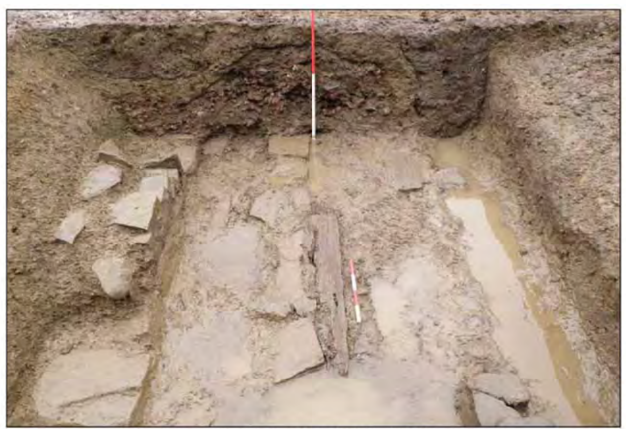
Plate 32. Stone lined drain (028) and Timber 1 (006) facing west.