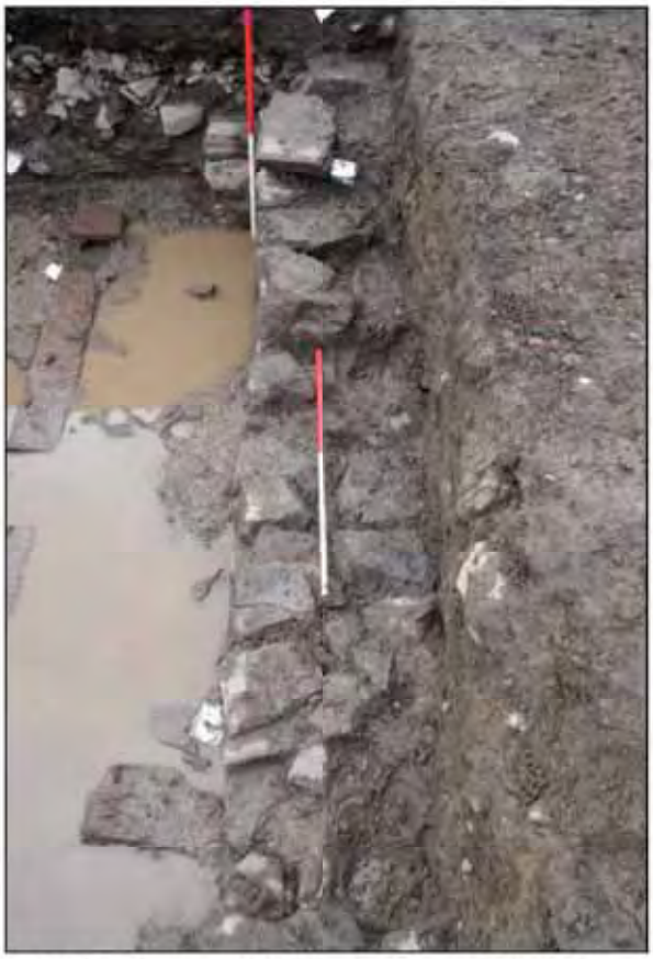
Plate 30. Northern wall (026) of culvert (005) facing west.