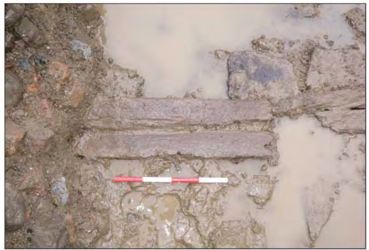
Plate 34. Timber 2 (006) facing south.