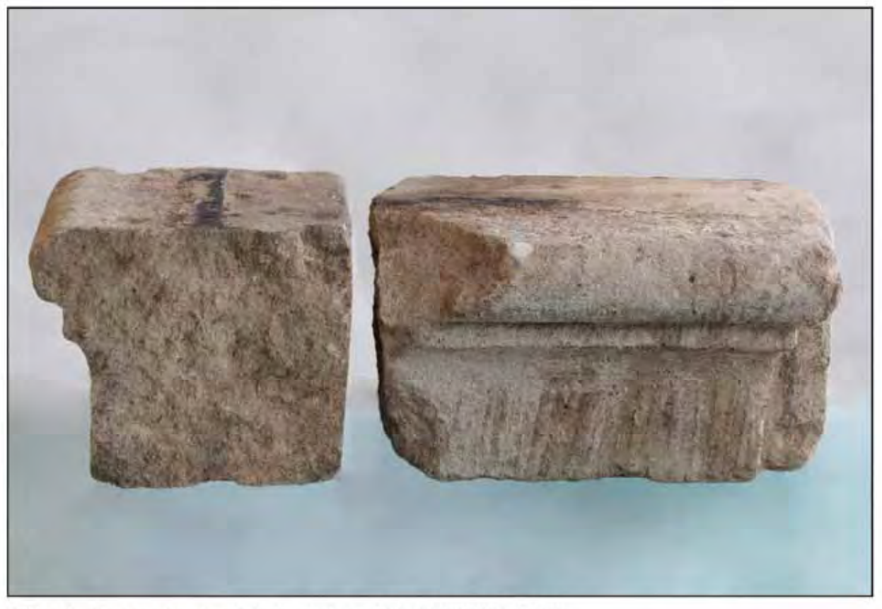
Plate 41 - Fragments of architectural stone (11E0458:009:052-053)