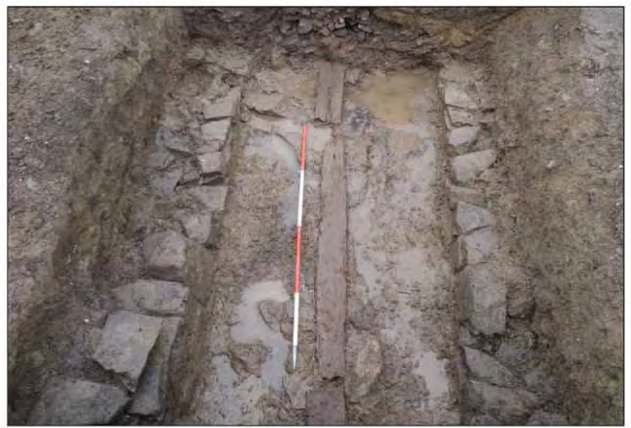
Plate 35. Timber 3 (006) facing east.