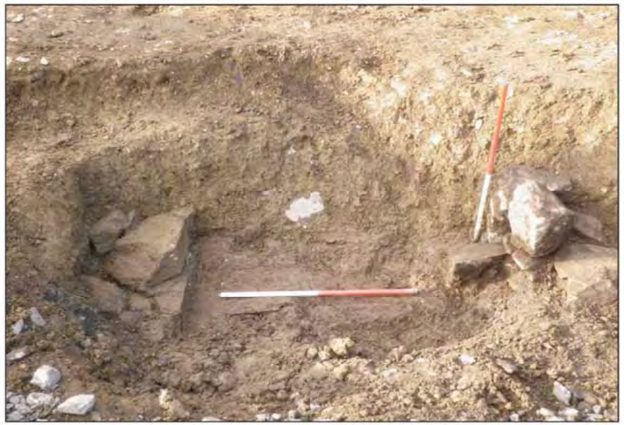
Plate 37. Timber floor (033) facing west.