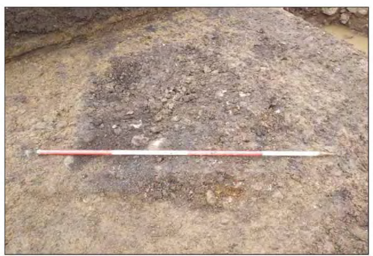
Plate 40. Mid-excavation of geotechnical test pit (010) facing north-west.